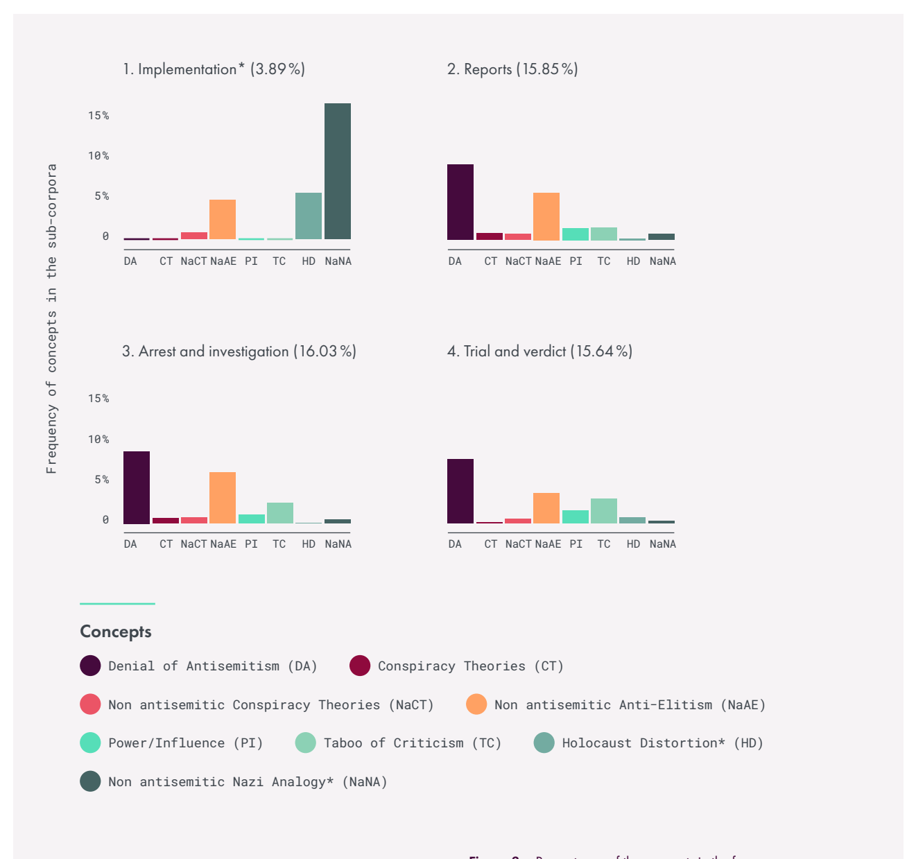
Figure 3 – Percentages of the concepts in the four sub-corpora (*In the Implementation sub-corpus, the occurrences of both HD and NaNA appeared in a thread where a few users – probably the same individual using different pseudonyms – repeatedly posted the same comments.)

As presented in Figure 3, these three major moments seem to trigger the same antisemitic concepts, although in different percentages, which will be presented in the following sections.